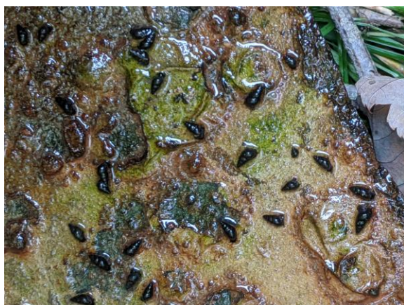
Figure 2. Rock infested with New Zealand Mudsnaills from Codorus Creek, Pennsylvania.

Notable Characteristics: NZM can achieve high densities within invaded waters (Figure 2); with some extreme estimates suggesting densities of over 299,000 snails per m 2 (Kerans et al. 2005).