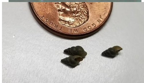
Figure 1. Top: Magnified image of New Zealand Mudsail. Bottom: New Zealand Mudsail shells with penny for scale.

Origin: NZM are native to freshwater environments in New Zealand and several surrounding islands. NZM have spread to numerous localities in Australia, Europe, and North America. In the United States, NZM were first reported from near the Snake River, Idaho, in 1987 (Benson et al. 2023).